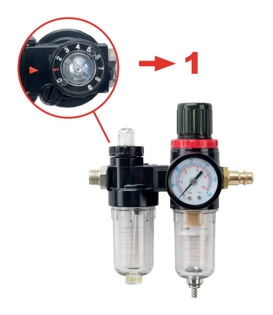
Fig. 5-1-1: Adjustment of the maintenance unit (old version)